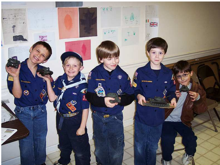
Are these guys happy, or what???