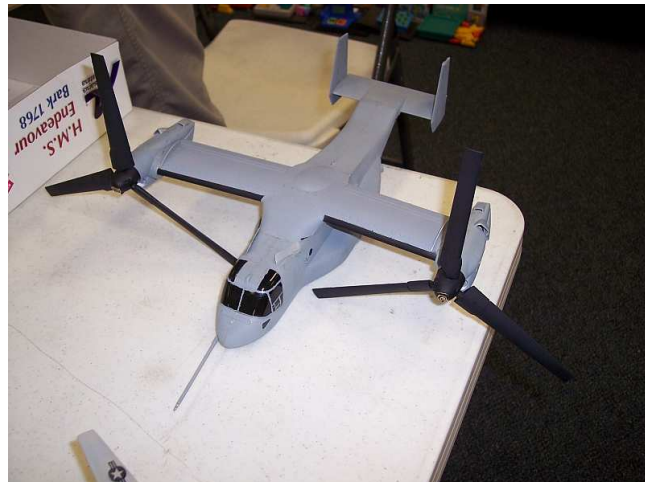
Preston's 1/48 Italeri V-22 Osprey under construction