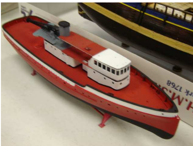
ChrisM also brought the Revell Fire Fighter fireboat, which is currently under construction.